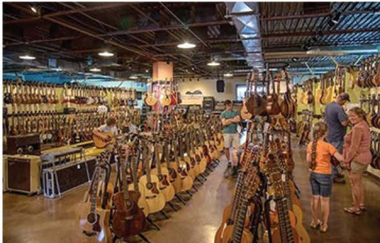
Carter Vintage Guitars is known for its great selection of classic guitars.