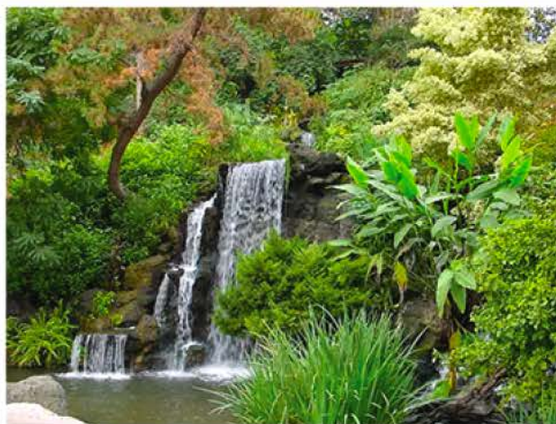
The Los Angeles Arboretum and Botanic Garden: Wildlife and Tracking in a Botanical Wonderland

The Los Angeles Arboretum and Botanic Garden, located in Arcadia, offers a serene environment where wildlife thrives among the diverse plant species. The 127-acre