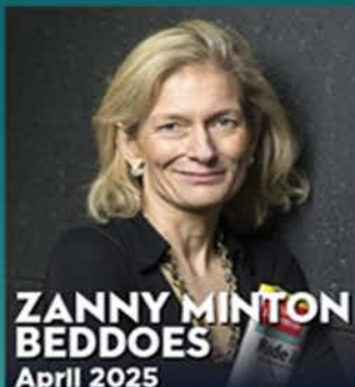
ZANNY MINTON BEDDOES April 2025